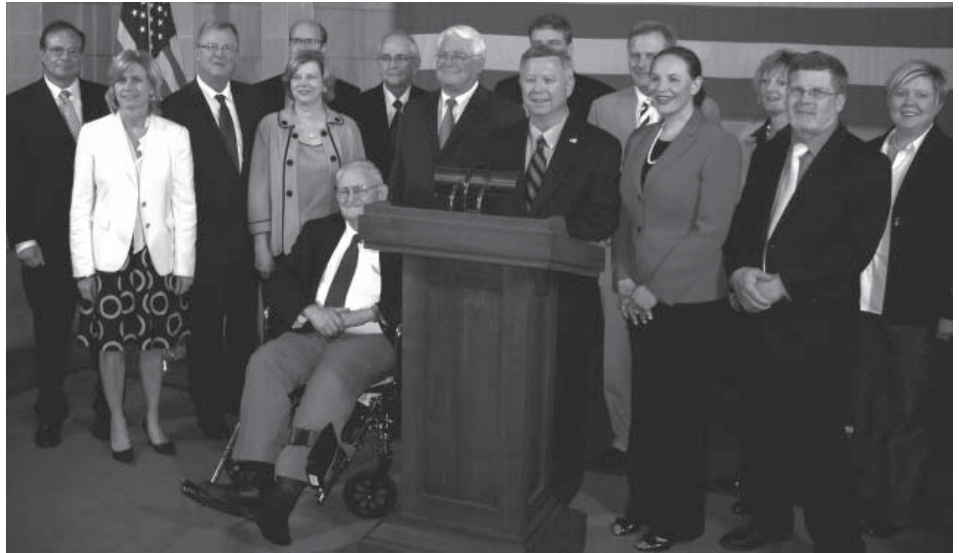
Pictured above is Governor Heineman at a recent signing ceremony, along with key senators and chamber of commerce representatives who helped ensure passage of the Talent and Innovation Initiative.